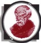
Colonel Henri Dijon

Laura is a 20 year old journalism major at Tulane University in New Orleans. A 1920's ingenue, she's studious and down to earth, energetic and courageous. She's known for her inquisitive nature, probably acquired from her father, a detective on the New Orleans Police force.