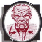
Dr. Wilbur C. Feels

Clarence is the Colonel's attorney. He manages all of the Colonel's business affairs and accounts. He seems rather sneaky, and it is said that he lusts after the Colonel's money.